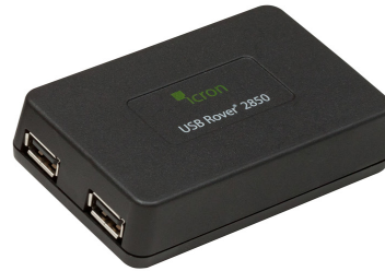
Remote Extender (REX)