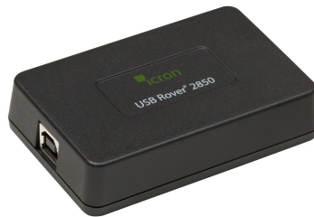
Local Extender (LEX)

The USB Rover ® 2850 extends USB connections beyond the desktop up to 40 meters (85 meters achievable with some Low-Speed HID devices such as keyboards and mice).