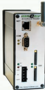
PROD0302 / 0303

The Multenet Broadband Router with an integrated HSDPA modem, is capable of speeds up to 7.2 Mbps down and 384Kbps up. Ideal for primary or backup internet connectivity or high bandwidth applications such as video.